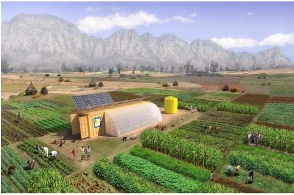
Fig. 3 The illustration of modern cassava's plantations and processing