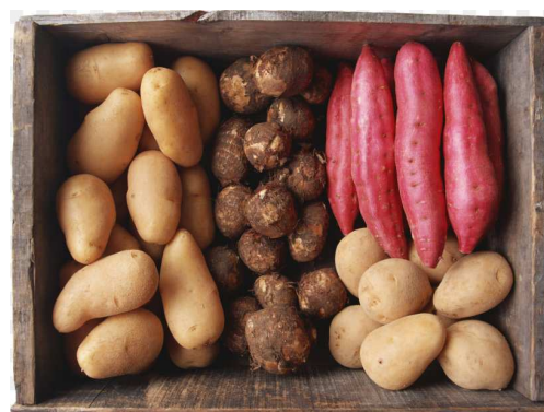
Fig. 1 Image of Cassava and Sweet Potatoes

from the neighboring Palembang regions, such as Banyuasin, Ogan Komering Ulu, Ogan Komering Ilir, and Muara Enim Regency [6]. Based on analysis from the Indonesian Society of Medical and Nutrient Physicians (PDGMI), tapioca provides more calories than potatoes, corn, rice, instant noodles, and bananas [7]. In every 100-gram serving, tapioca provides 363 calories, the highest among others as in rice, instant noodle, potatoes, corn, sweet potatoes and bananas that provides 335 calories, 337 calories, 83 calories, 129 calories, 123 calories, and 88 calories respectively [8] (see the fig 1).