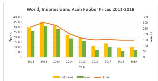
Fig. 1 World, Indonesia, and Aceh Rubber Prices, 2011 – 2019

has also reduced demand for vehicles, both motorbikes and cars. Meanwhile, 70% of natural rubber is consumed by the world tire industry. World rubber prices, Indonesia (national) and Aceh for 2011 to 2019 can be seen in Figure 1 below: