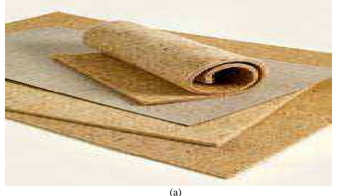
Fig. 6 (a) Natural fiber mat (b) Door inner panel