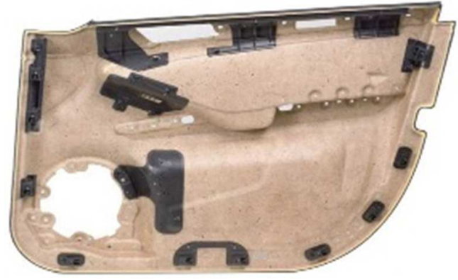
Fig. 7 Heated and molded mat into door panel