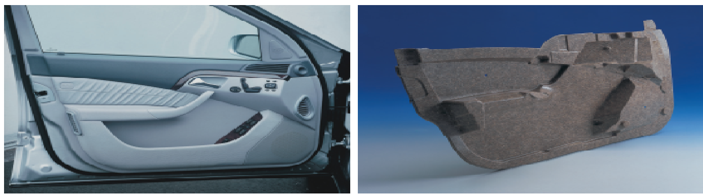
Fig. 5 Modern door inner trim panels are molded using mats of 60% natural fiber in a Baypreg® polyurethane resin [23]