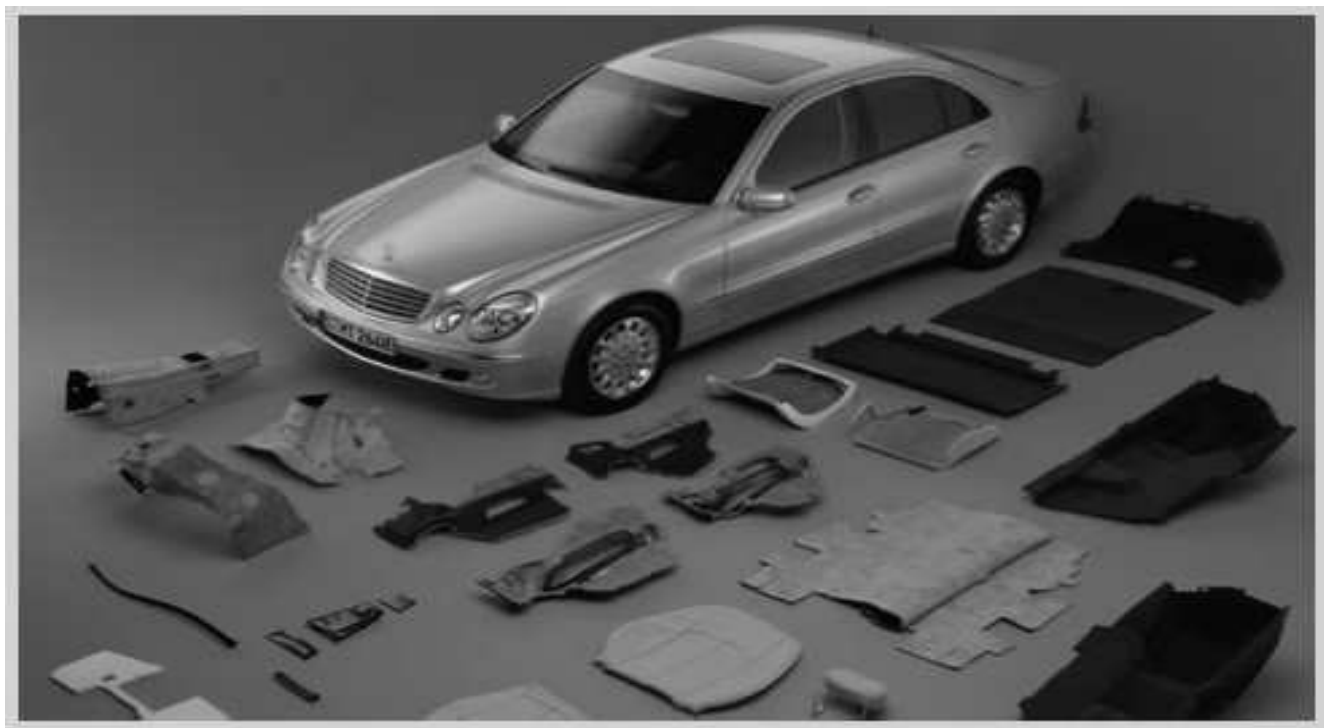
Fig. 4 Flax, hemp, sisal, wool and other natural fibers are used to make 50 Mercedes-Benz E-Class components [5]