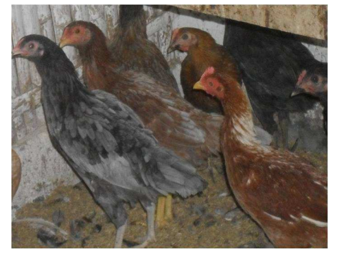
Fig. 1 The Sentul Hen

maintained eggs, so it is often rejected by the cake-making industry.