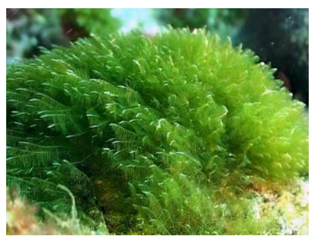
Fig. 2 Spirulina

benefits in native chicken rations. Thus, it is necessary to find alternative feed additives are inexpensive, easy to obtain; the quality is good, as well as non-food [6]. The addition of supplement in the ration can overcome the problem of amino acid deficiency, vitamins, and minerals and can prevent protein deficiency. Spirulina (blue-green alga) is one of the high-quality natural feed supplement that can be used in animal and poultry nutrition [7]. There are two different species of Spirulina: Spirulina maxima and Spirulina platensis, with varying distribution throughout the world [8].