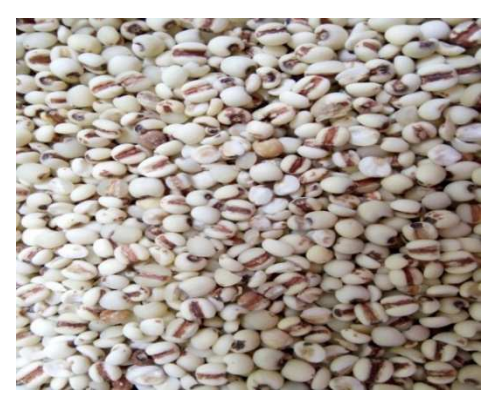
Fig. 2 Polished Adlay of Genotype #G44 Grain