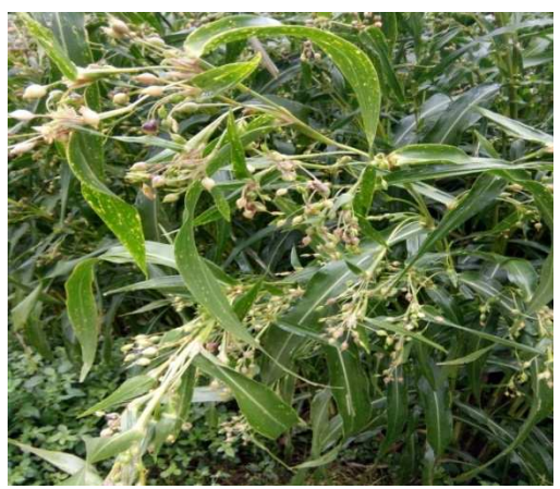
Fig. 1 Adlay Plant of Genotype #G44

The materials used were Adlay genotype #G44 and white male Wistar rats. The Adlay genotype #G44 used was retrieved from local varieties of West Java Adlay which was planted in the farming laboratory of Universitas Padjadjaran (Figure 1 and 2).