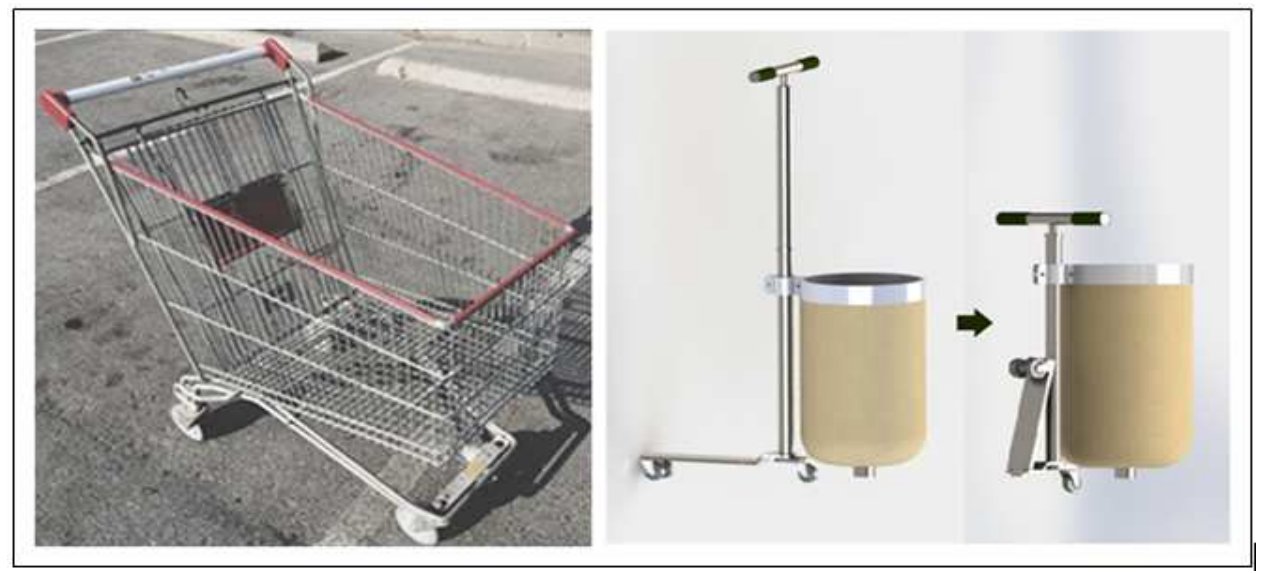
Fig. 4 Old design and proposed shopping trolley design