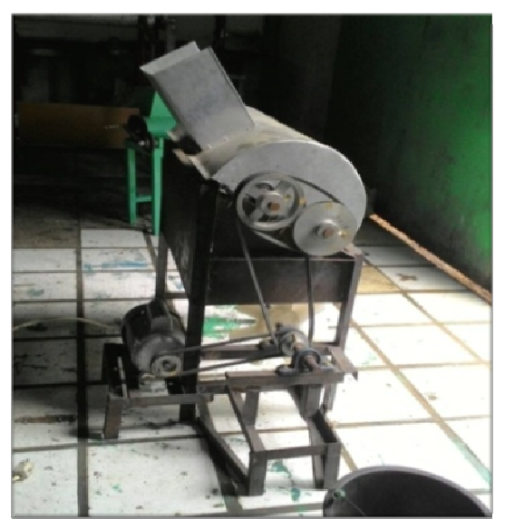
Fig 1. Trimmer machine Dried Leaves Onion

and 7 pieces of fan leaves was used to blow the separated dry leaves from onion bulbs. The source of blower and trimmer shaft driving force came from the same an electric motor. Main frame made from iron elbow (3.5 cm x 3.5 cm) with size of 40 cm x 60 cm x 60 cm (L x W x H). Iron elbow was used since it can withstand the weight of thresher component and material. The trimming machine used a 0.5 Hp electric motor as a driving source. Transmission system of pulleys and belt was used to transfer the power from the electric motor to the trimmer shaft. Rotation speed of the electric motor and the shaft trimmer row was 1400 rpm and 700 rpm respectively. Pulleys diameters of the electric motor and the shaft trimmer row were 3 inches and 6 inches.