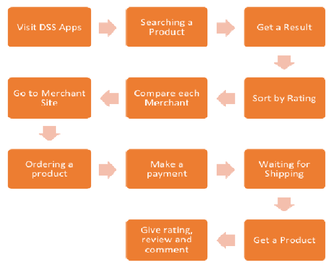
Fig. 2. Decision Support System for E-Commerce Processes

The process proposed for the activity from the beginning to the end of the process is as follows: