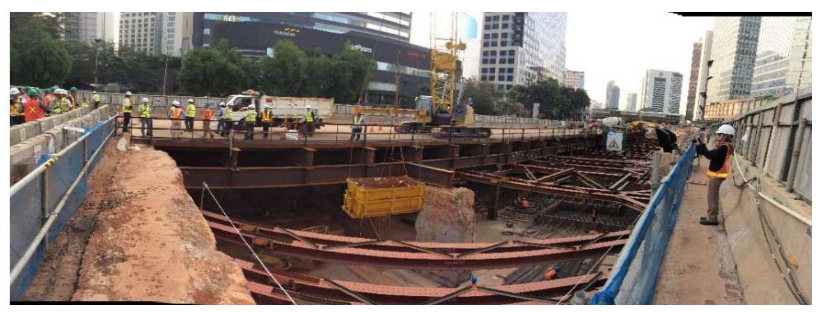
Fig. 11 Top down construction method to reduce traffic disturbance

excavation and the partial opening is left open for the baby backhoe to go down and also to transport material out of the openings. The reason to use the top-down construction method was due to the wide opening for braced excavation.