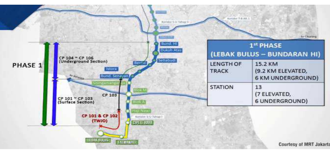
Fig. 1 Jakarta MRT – phase 1

The first phase of Jakarta MRT consisting of the elevated structure at about 10 km from Lebak Bulus to Sisingamangaraja (with seven stations: Lebak Bulus, Fatmawati, Cipete Raya, Haji Nawi, Blok A, Blok M and Sisingamangaraja) with the transition to the underground structure. The depo will be located at Lebakbulus. The underground part consists of 6 stations (Senayan, Istora, Bendungan Hilir, Setiabudi, Dukuh Atas and Bunderan Hotel Indonesia. Figure 1 shows the position of the MRT stations and Figure 2 shows the example of the integrated future station in Jakarta. Figure 3 describes the expected situation when Jakarta MRT has been completed. The use of underground space and upper ground space is to limit the disturbance of the existing traffic condition.