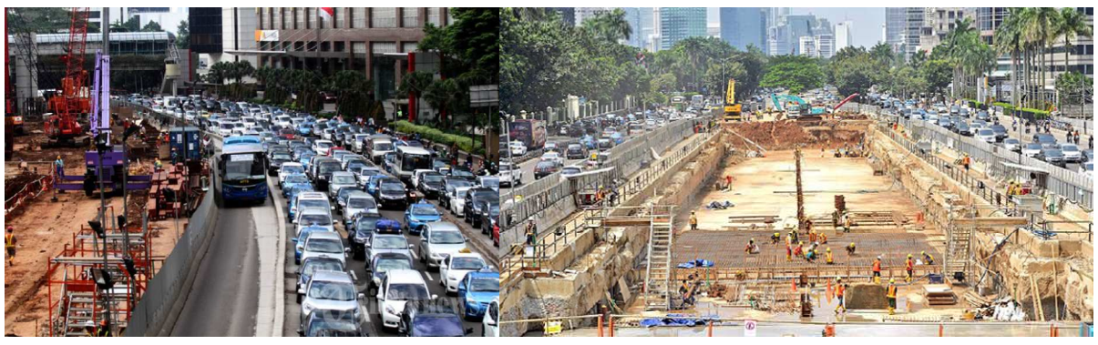
Fig. 8 Managing the traffic flow around the excavation in the North Corridor

excavation. Figure 8 shows how traffic is squeezed into fewer traffic lanes while the busway lanes are still provided. Figure 9 is the bird eye view of the traffic situation in the north corridor.