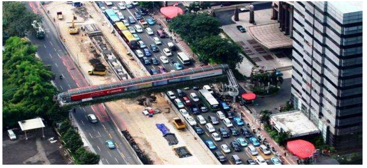
Fig. 9 Traffic Management and Construction Management come into the complexity

Access for vehicles, structural members and concreting in and out of the construction site are in fact, part of the management of traffic. The construction manager shall collaborate with the traffic regulator.