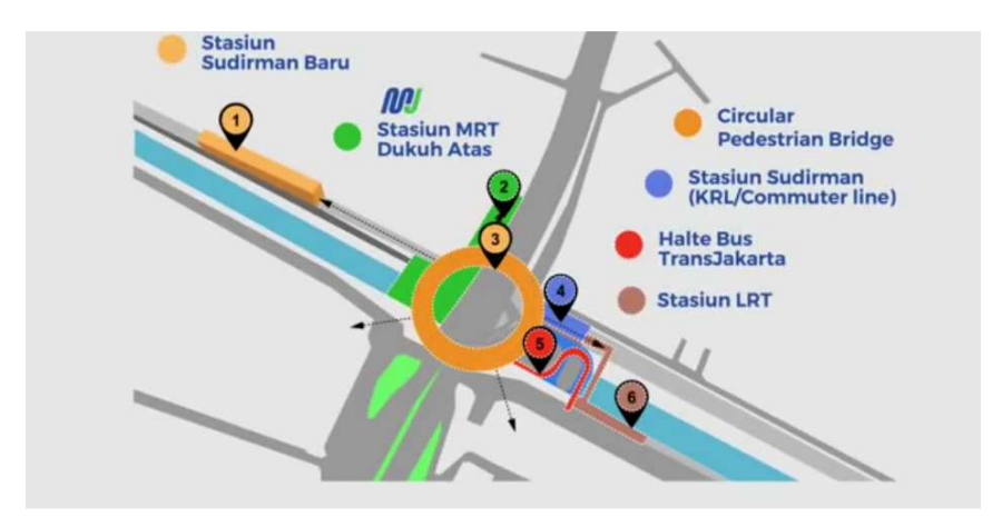
Fig. 2 Example of Future Integrated Transportation System