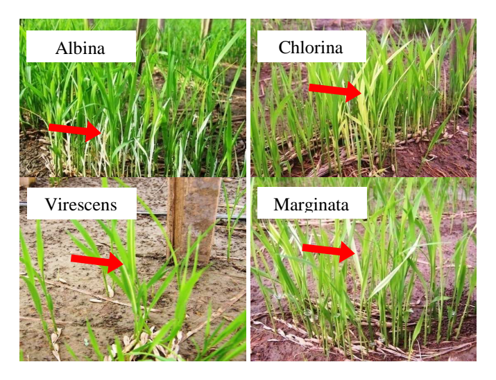
Fig. 2. Movements of chlorophyll which appeared on the M2 generation

Frequency of chlorophyll mutants in M<sub>2</sub> population can also be seen in Table 1. Of the seven types of chlorophyll mutations are formed, the number of mutations towards albino higher when compared with other types of chlorophyll mutations. Chlorophyll mutation frequency obtained 0.17% and 1.10% mutant frequency. It is lower when compared to the results reported by [31] by 7.7% on the variety Hitomebore [26] of 11.2% and 6.4% on the cultivar Kuriak Kusuik and Randah Putiah. Tinggi. Chlorophyll mutations that occur in a population of M<sub>2</sub> derived from gamma-ray irradiation at a dose of 200 Gy. a mutagenic effect of gamma irradiation at a dose indicating that the genetic diversity of the population has created M_2 . [31] and [26] also reported that a dose of 200 Gy is the irradiation dose that is effective in generating useful genetic diversity in breeding programs.