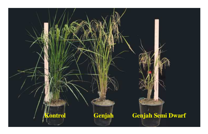
Fig. 3. Mutant very early maturing and early maturing mutants with semi-dwarf stature genetic improved results through induced mutation were found in M_2 population

Table 4. In Table 3 shows that the result of individual selection of the candidate mutant very early-maturing group (age 70-80 days flowering) that is as much as 8 plants, and the group of candidates mutant early maturing (flowering age 81-90 days) as many as 78 plants, the mutant frequency of 0.14%. As for the origin of plants (control) contained in the flowering age groups of 91-100 days. Mutant very early maturing and early maturing mutants with semi-dwarf can be seen in Figure 3.