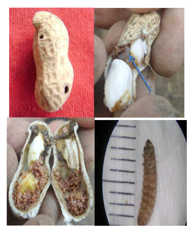
Fig 1. Holes on peanut pod and larvae feeding inside in pod (above), faeces remaing inside pod, and the 4^{\rm st} instar larvae