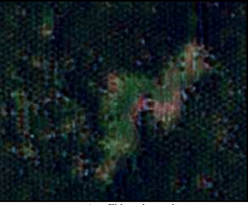
a) Ehlers sharpening

The quality of the classification depends on the quality of the images as the main input. The pansharpening image was selected based on a comparison between Ehlers and Brovey method. The result showed that Ehlers provide a slightly better in quantitatively separating the object, but lower quality in detail spatial assessment compared to the Brovey (Fig. 1). However, in the OBIA classification, the method also requires a high spatial accuracy. Therefore, the Brovey was chosen as the input base-image to the OBIA process