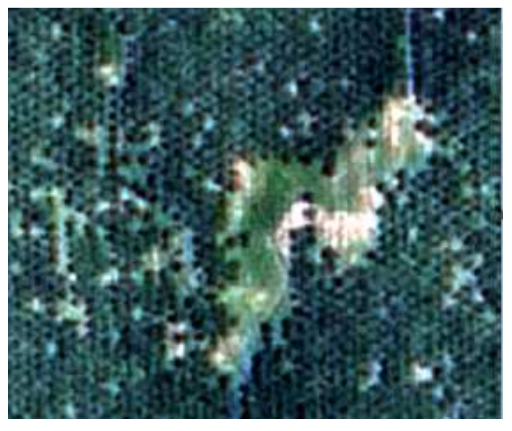
b) Brovey sharpening