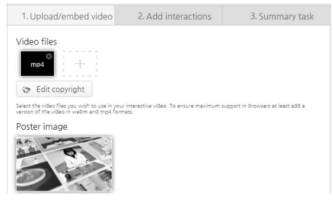
Fig. 1 The screenshot of developing contents in the step of uploading video

In the section of suggesting keywords bold subtitles are synchronized with the video for controlling attention of learners and screen design for emphasizing text or image effect is included in order to recognize the aural keyword as a visual one. The contents which are not included in the screen are put in the type of animated GIF and text pop-up.