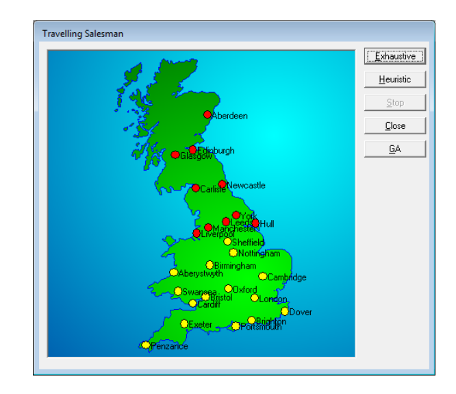
Fig. 3 An example of modified program with 10-cities selection in red with addition of GA function