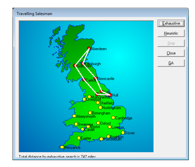
Fig. 4 Examples of 8-cities results based on Exhaustive, Heuristic and GA with 170 of iterations and 100 of population size

however, until to some extent, exhaustive halted. While in the meantime, heuristic managed to stay consistent with a marginal increase. By referring to this result, we observed that heuristic took less time than exhaustive and GA. While GA outperformed the others on giving optimized path regardless of how big the traversal is. We are optimist that a better result can be obtained if other programming language is used. This is due to the nature of Prolog that always backtracks, causing a simple process taking longer than usual.