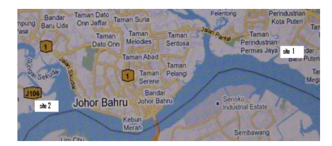
Fig. 1 Site of experimental