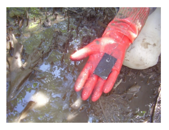
Fig. 2 Steel coupons taken at Permas Jaya

The steel corrosion which takes place in the marine environment consisting water and oxygen has lead to creation of black rust, which also known as Fe<sub>3</sub>O<sub>4</sub> giving blackish colour on the surface of both specimen. Identified as insoluble product, black rust or Fe<sub>3</sub>O<sub>4</sub> is a result of reaction between ferrous and hydroxide ion leading to creation of Ferrous Hydroxide (FeOH<sub>2</sub>) which then react further with additional hydroxide ion and sometimes also oxygen [7]. Other than that, it is also noticed that the coupons retrieved from near shore site has more uneven surface as compared to off shore site. The loss of smoothness on the coupon surface is an initial indication of more pitting corrosion points to appear on the surface if the exposure period becomes longer.