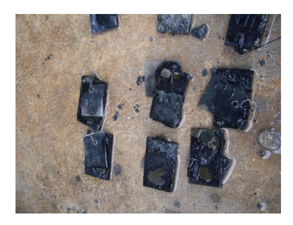
Fig. 3 Steel coupons taken at Danga Bay