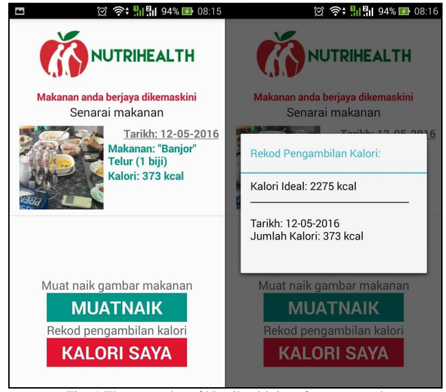
Fig. 1 The examples of Nutrihealth interfaces screenshots

After the 3-day usage of the mobile application, participants were asked to answer a set of questions. The questionnaires were divided into 3 parts to capture different aspects: demographic information, user acceptance of technology and persuasive component. The questionnaires were carried out together with a face-to-face interview to clarify some of the answers to the questionnaires. The interview sessions were recorded and analysed with the participants' permission. Fig. 2 shows the study flowchart.