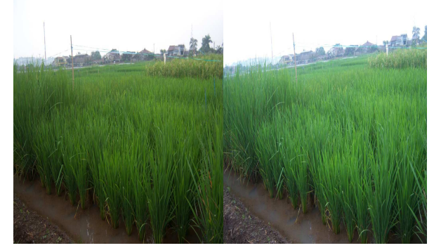
Fig. 2 Performance of agronomic characters of F3 lines selected by Recurrent Selection (RS)

Agronomic characters were observed in a population of RS, as well as the parent is presented in Table 2 and Fig. 2. There was a diversity of agronomic characters in all character observed. Plant height of populations derived Bugis/IR7858-1 and Bugis/IR148 were very tall (>131cm), as same as Sriwijaya/IR148 ranges between 103-140 cm (Table 3). Plant height derived Bugis/IR7858-1 taller than elders. According to plant height standards developed by [20], the population of lines generated Bugis by RS result is more directed at the parent which is between tall to very tall (Table 3). The Sriwijaya as parental had moderate plant height criteria, and Bugis had a very tall, while IR7858-1 and IR148 had criteria between moderate to tall, indicating that the two parents are not stable and there is still segregation between populations.