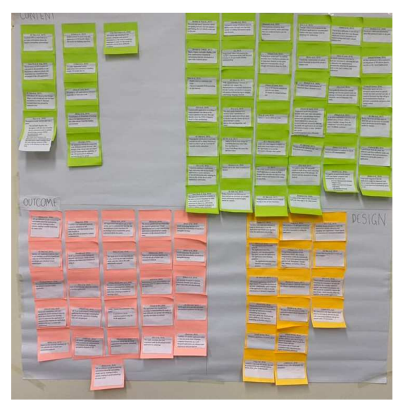
Fig. 1 An iterative process in developing themes: Content (green), Design (Orange), Outcome (Pink)

discovered from the literature review was content, design, and outcome, as seen in Figure 1.