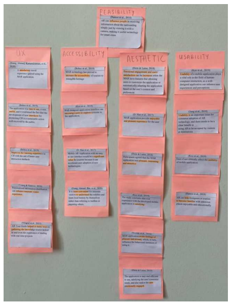
Fig. 4 Sub-themes for outcome