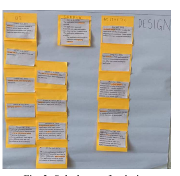
Fig. 3 Sub-themes for design