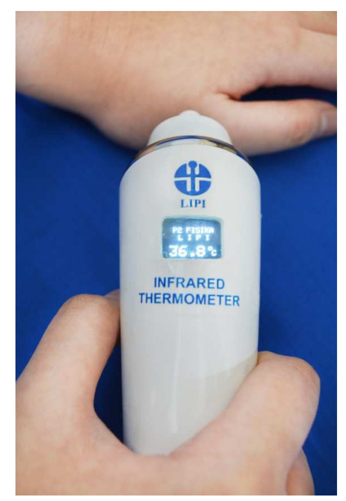
Fig. 1 A calibrated our own made infrared thermometer was used around 1 cm from the target. Although other general infrared thermometers are not interchangeable [21], this instrument can be used to measure equally well the ear canal and overhead

The core and peripheral compartment measurements in this study are related to the surface temperatures of human skin. For this sake, infrared thermometers are accurate [16], quick, [17], inexpensive, easy to use [18], efficient [19], and non-contact [20] thermometers. Our own made infrared thermometer was used to accommodate this research (Fig. 1). It is different from other general infrared thermometers that are not interchangeable [21]; our developed infrared thermometer can be used to measure equally well for the ear canal and forehead.