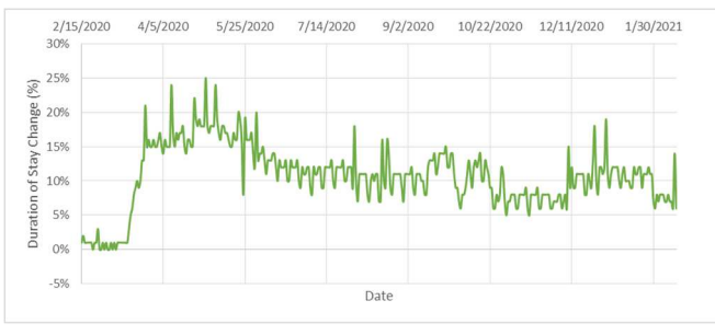
Fig. 2 Duration of Stay Change (%) in Residential Area [27]

al. [5] in several countries such as Australia, Brazil, China, Ghana, India, Iran, Italy, Norway, South Africa, United States show the dynamic of modal shifts and people's cognitive-behavioral responses to the travel restrictions. Other studies show that threat severity and susceptibility create 'travel fear', which stimulates protection motivation and protective travel behavior [30].