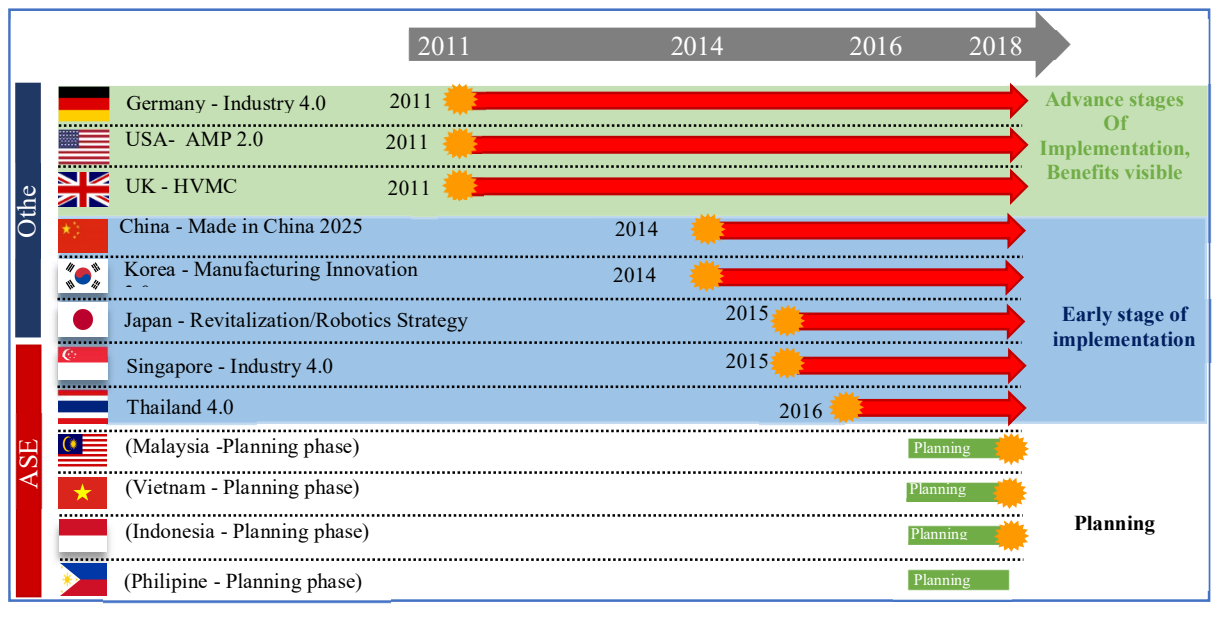
Fig. 1 Policy Launch Timeline of I4.0 Initiatives in ASEAN and Other Countries [8]

goods globally, referring to the World Trade Organization in 2019 [9]. To reach ambition to be the global hub for the manufacturing, Singapore Smart Industry Readiness Index reflected industry maturity translating I4.0 concepts and technologies into new value. Singapore moved ahead of its neighbors in preparing the industry to adopt I4.0.