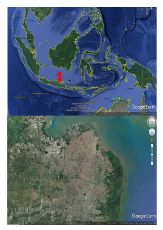
Fig. 1 Location and Surabaya city of Indonesia (top) [6] and the city (bottom) [7]

The city is divided into 31 administrative subdistricts (Fig. 2). A dense area's planning strategy in one of Surabaya city centres shows the mixed complexity of the old city area [8]. However, several areas are considered activity centres in slightly varying degrees, as shown in Fig. 3.