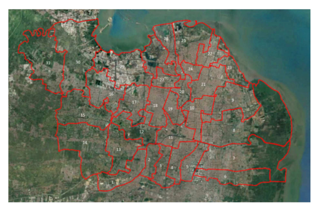
Fig. 2 Subdistrict administration in Surabaya (background [7])

A weak planning and development regulation of the city makes its centre to be unclearly defined. It is common for a smaller city to have a centrum, or several developed new centres, forming a monocentric or polycentric city [9].