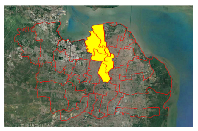
Fig. 4 Subdistrict close to the centre of concentric model (background [7])

The concentric model in Surabaya is shown in Fig. 4. The city activity centres consist of zones 19, 20, 26, 27, and 28, while the rests are peripheries.