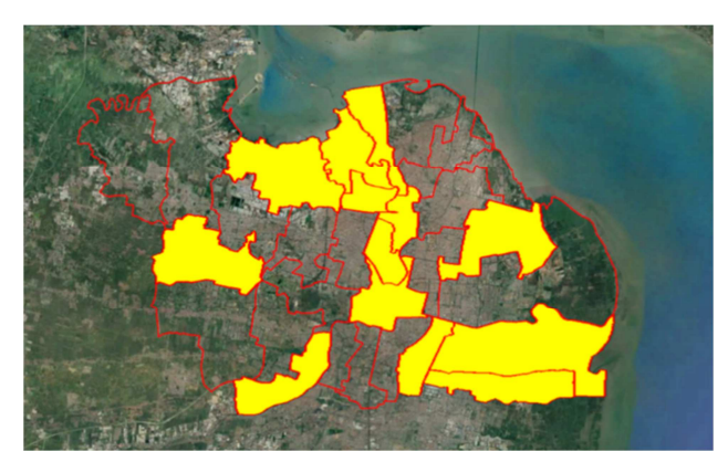
Fig. 6 Subdistrict close to centres of multiple nuclei model (background [7])

Trip Attraction Considering Geographical Weighting based on Multiple-nuclei Model. The Multiple-nuclei model in Surabaya is shown in Fig. 6, in which multi-nuclei centres consist of zones 1, 3, 6, 7, 9, 11, 15, 19, 20, 26, 27, 28, and 29, while the rests are peripheries.