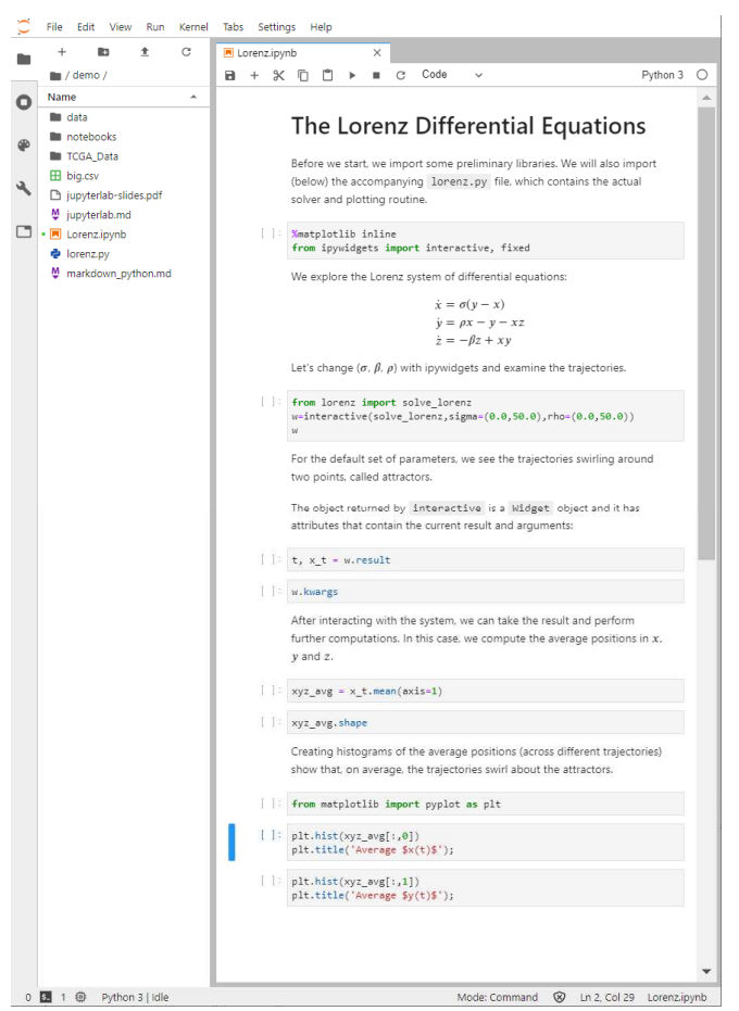
Fig. 4 An example of a Jupyter Notebook in a web browser (https://jupyter.org/try).

Furthermore, the Python-related tools that help study programming exercises are easy-to-use with no program installations when needed; the only required one is a web browser. Fig. 3 shows the Python shell in a web browser. With the Python shell in a web browser, anyone who wants to learn Python programming can access the programming environment. However, we teach the big data analytics course in a computer-based lecture room with Python and related tools installed for the learning effectiveness.