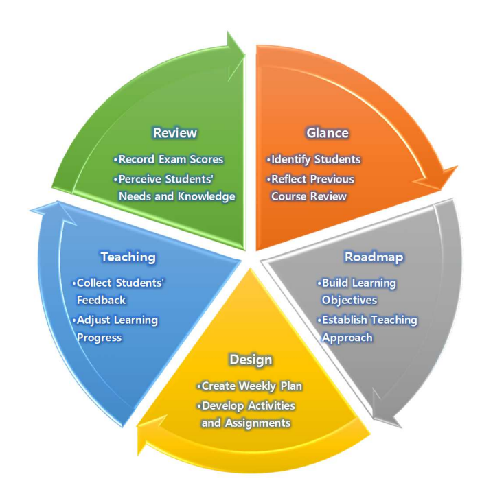
Fig. 2 The proposed course design model.