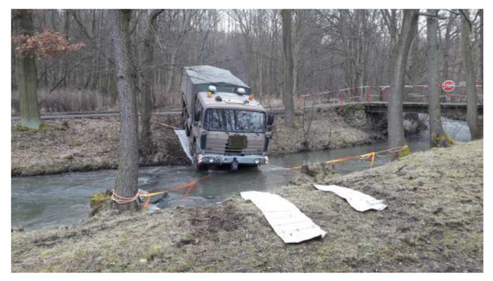
Fig. 3 Passes of the vehicle with plastic mats - both directions [25]

In addition to the classic methods of overcoming nonexplosive barriers using military vehicles, explosives, or by hand, it is possible to use plastic mats to overcome some types of barriers. It is primarily about overcoming scattered wire or anti-personnel wire barriers.