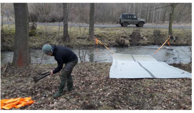
Fig. 2 The possible way of terrain fixing [25]

Establishing and maintaining any water-crossing sites shows that new technologies for strengthening low-endurable terrain are essential to support the flow of transport across watercourses (Figure 2 and 3). It includes arrival and departure routes to the water-crossing site and areas of concentration of transport means and material, checkpoints, and more. Here, the already mentioned modular plastic devices proved to be fully effective during the exercises.