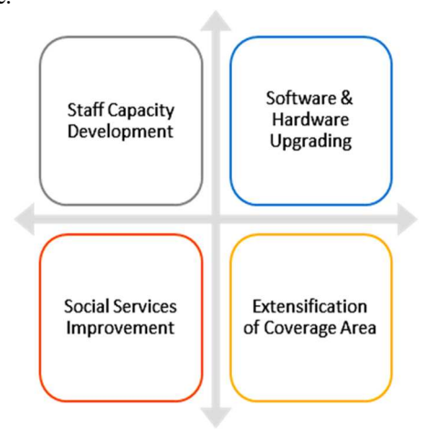
Fig. 5 Area of improvement for the application based SLRT

First, regular training is needed to be improved to develop the competency of social workers. Various training needs to be added, so does the frequency. Second, software and hardware upgrading is utmost importance in avoiding further delay in services due to glitch and error in the system. Electronic data management (EDM) services, electronic medical records (EMR), and electronic health records (HER) are good examples of software application platforms that social workers might use to managing client's personal data. Third, now, social welfare services provide are limited to social-economic, education and health. Additional services may be added on the characteristics of local people where Puskesos is located. Fourth, given the possible upgrading of software, hardware, and additional staff, extending the services' coverage by adding more villages or even replicating SLRT in other districts is possible. Taken together, the nexus between social work practice and ICT are the resources of people and technology. The human capacity that resilient and resistant could optimise the usage of ICT to achieve social welfare.