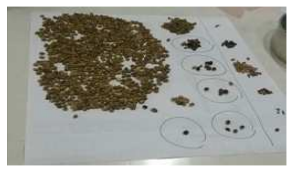
Fig. 2 Coffee Beans Quality Test

3) Defect Value: The defect is the sum of the value of coffee beans defect, Test of Defect done when coffee beans are ready to export to determine the coffee's quality or grade. To determine defect can use two systems, namely the Indonesian National Standard and standard Specialty Coffee Association of America (SCAA) [19].