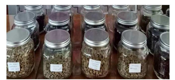
Fig. 1 West Sumatera Arabica coffee beans samples

The criteria for determining the quality of coffee beans refer to the physical test standard of Indonesian National Standard [18] and the standard of Specialty Coffee Association of America (SCAA) [19]. The physical test stages of coffee beans that are commonly done are water content test, Tracee test, defect test, color/smell test, and seed size test. The Minang Coffee Association in the Ranah Minang uses the criteria of physical quality value, water content, seed defect value, and land elevation for quality determination of coffee Physical testing is a system used to assess the quality of coffee beans based on their physique, either using AIDS or using the human senses in accordance with the prevailing standards.